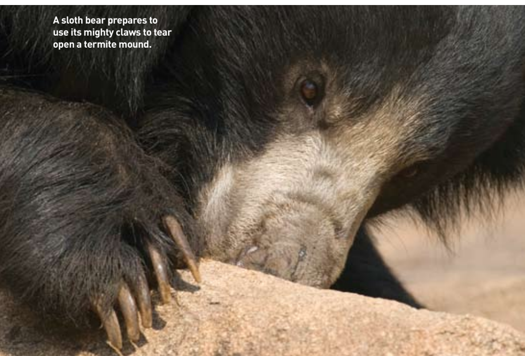
A sloth bear prepares to use its mighty claws to tear open a termite mound.