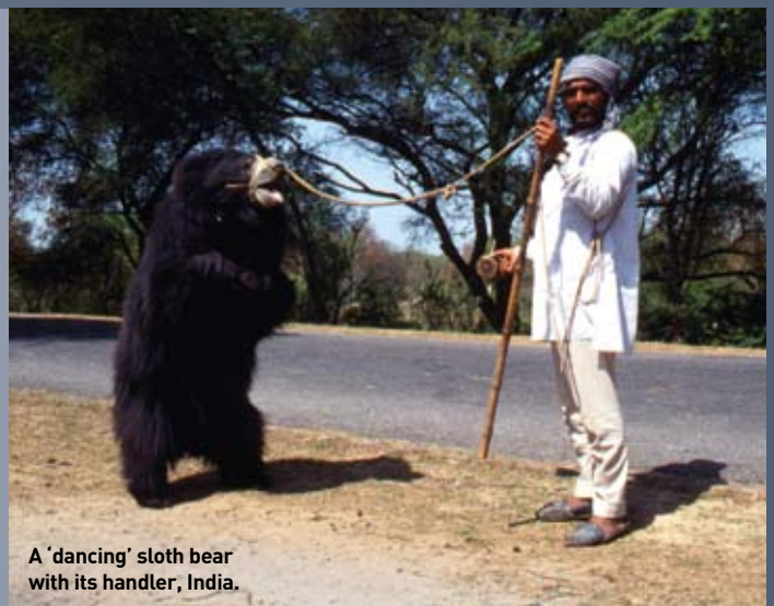
A 'dancing' sloth bear with its handler, India.

THOUGH THIS CRUEL practice is banned by law, there is a lack of enforcement. The Indian charity Wildlife SOS seizes dancing bears and cares for them at several rescue centres, since they cannot be returned to the wild. More than 400 individuals have been rescued so far, but an estimated 500 are