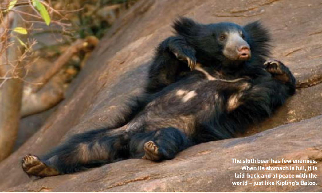
The sloth bear has few enemies. When its stomach is full, it is laid-back and at peace with the world – just like Kipling’s Baloo.