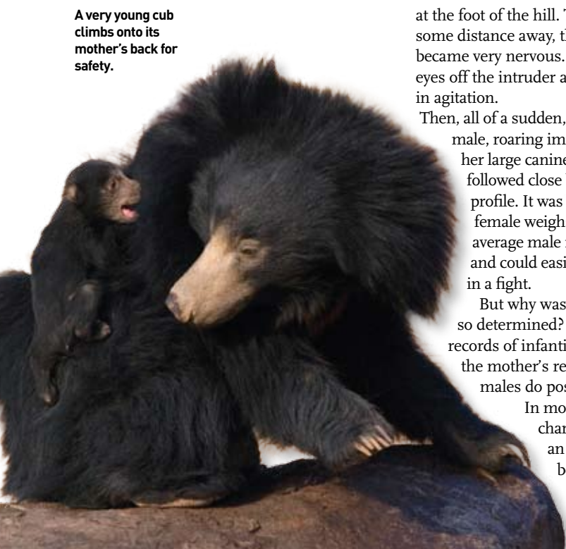
A very young cub climbs onto its mother's back for safety.

at the foot of the hill. Though he was still some distance away, the mother immediately became very nervous. She didn't take her eyes off the intruder and paced up and down in agitation.