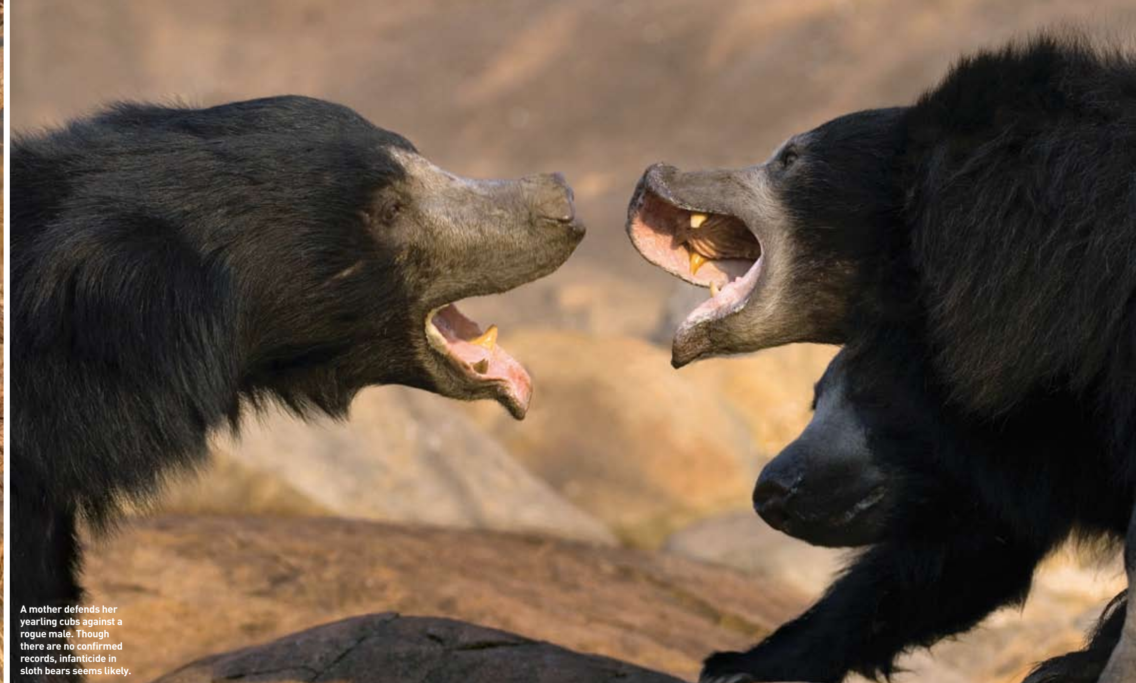
A mother defends her yearling cubs against a rogue male. Though there are no confirmed records, infanticide in sloth bears seems likely.