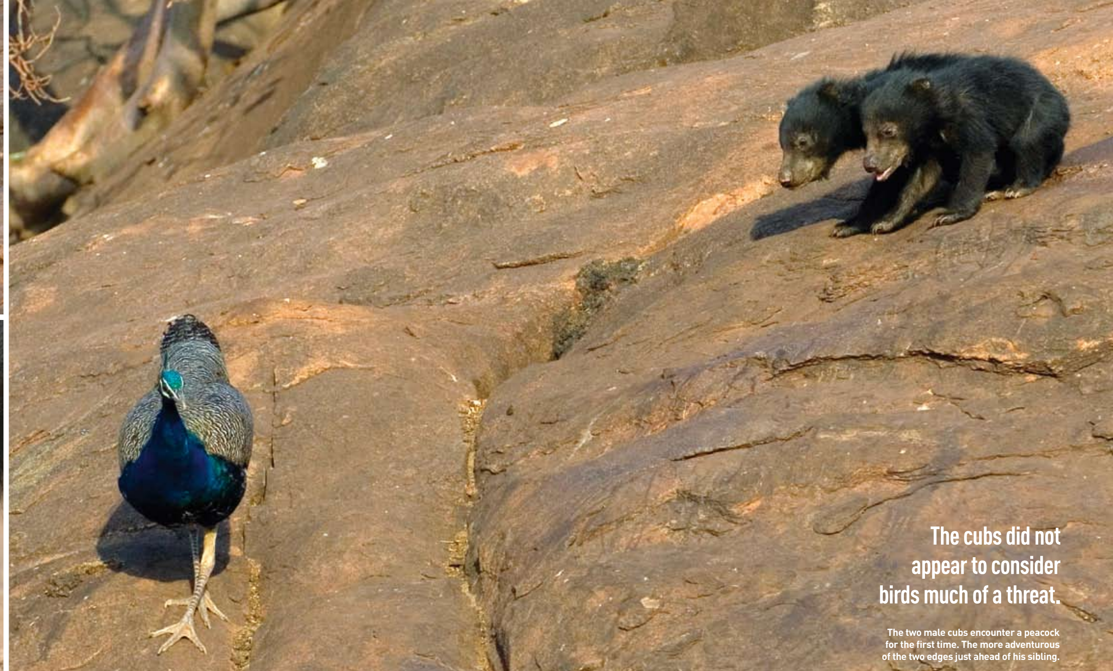
The cubs did not appear to consider birds much of a threat.