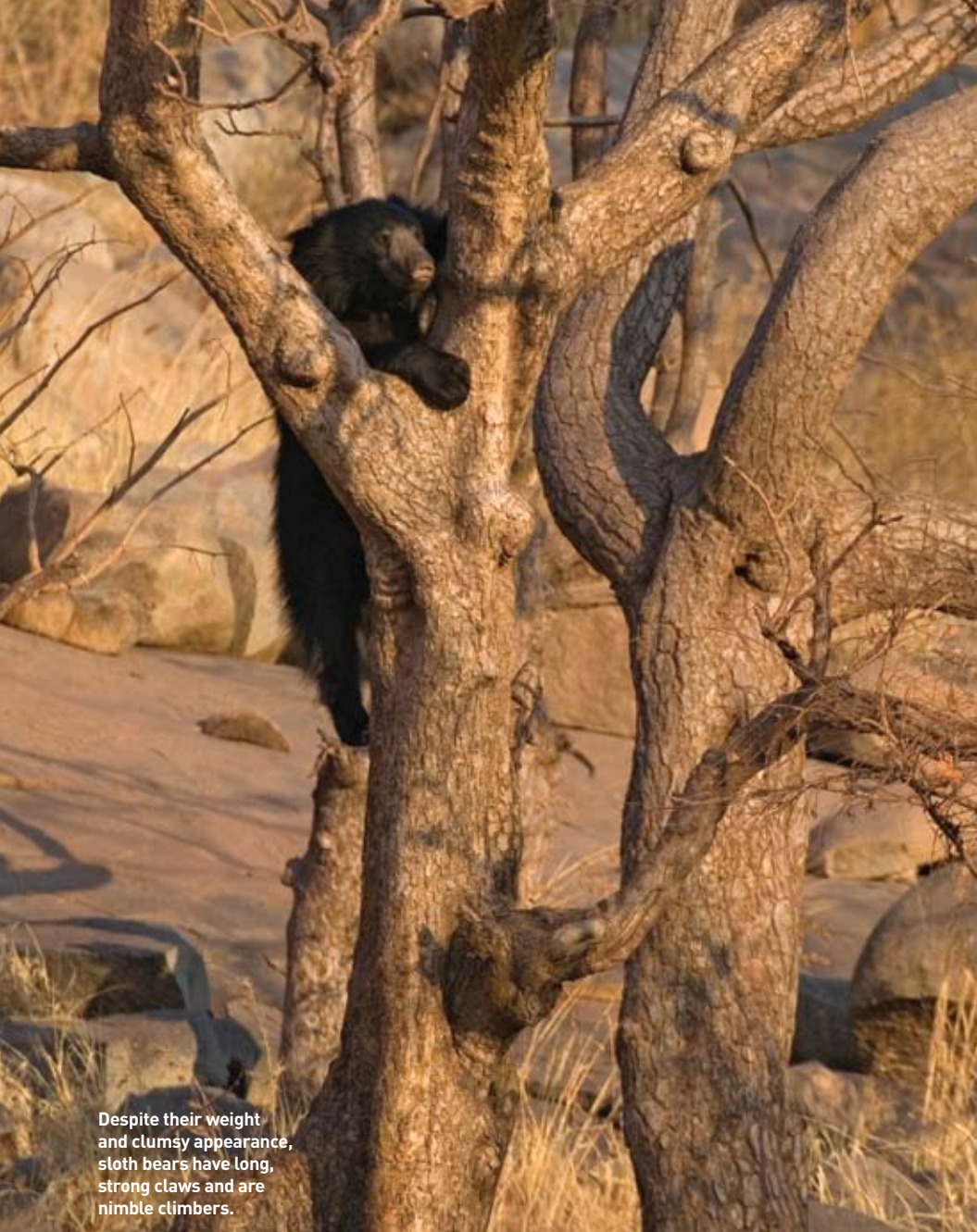
Despite their weight and clumsy appearance, sloth bears have long, strong claws and are nimble climbers.