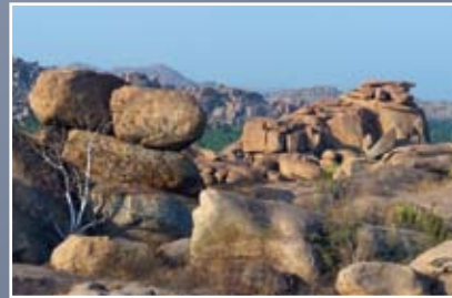
Sloth bear distribution (1990)

DAROJI BEAR SANCTUARY was created in 1994 and is situated 15km from Hampi, a World Heritage Site in the south Indian state of Karnataka. In addition to sloth bears, leopards, striped hyenas, jackals, mongooses and wild boar roam the area.